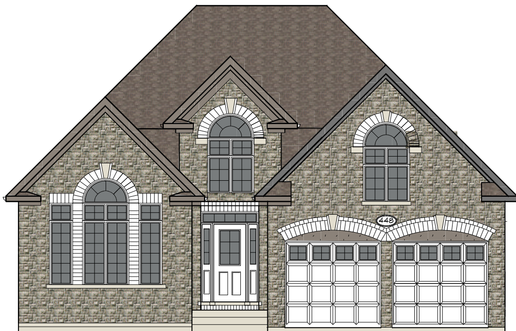
THE BUTTERNUT FRONT ELEVATION